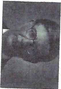
George Will SYNDICATED COLUMNIST

At daily morning meetings, heads of the FBI's various divisions report on espe-